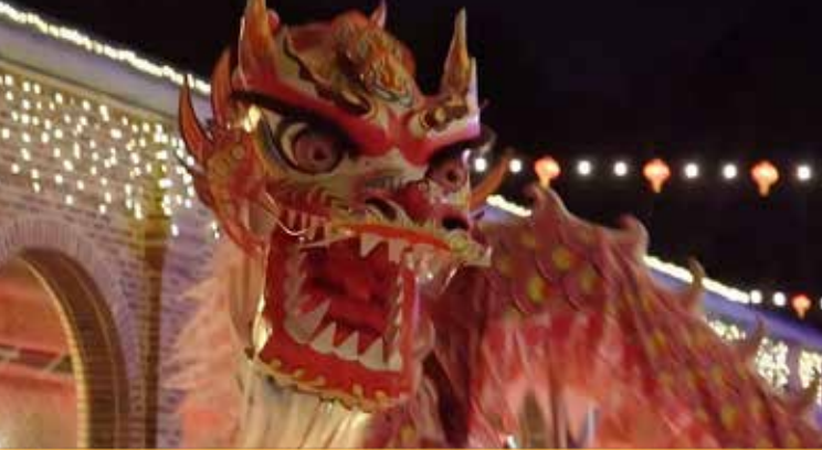
FEBRUARY 10 - 25, 2024